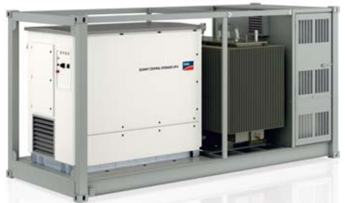
Medium Voltage Power Station with Sunny Central Storage UP-S