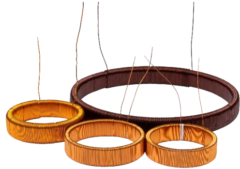
Figure 1. General view of products